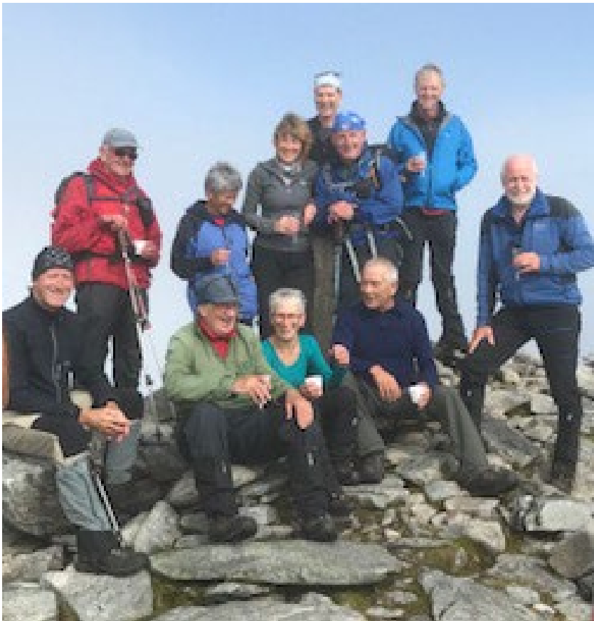
Current SMHC Compleators