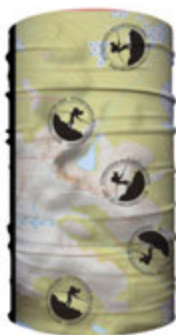
Ways to wear your buff