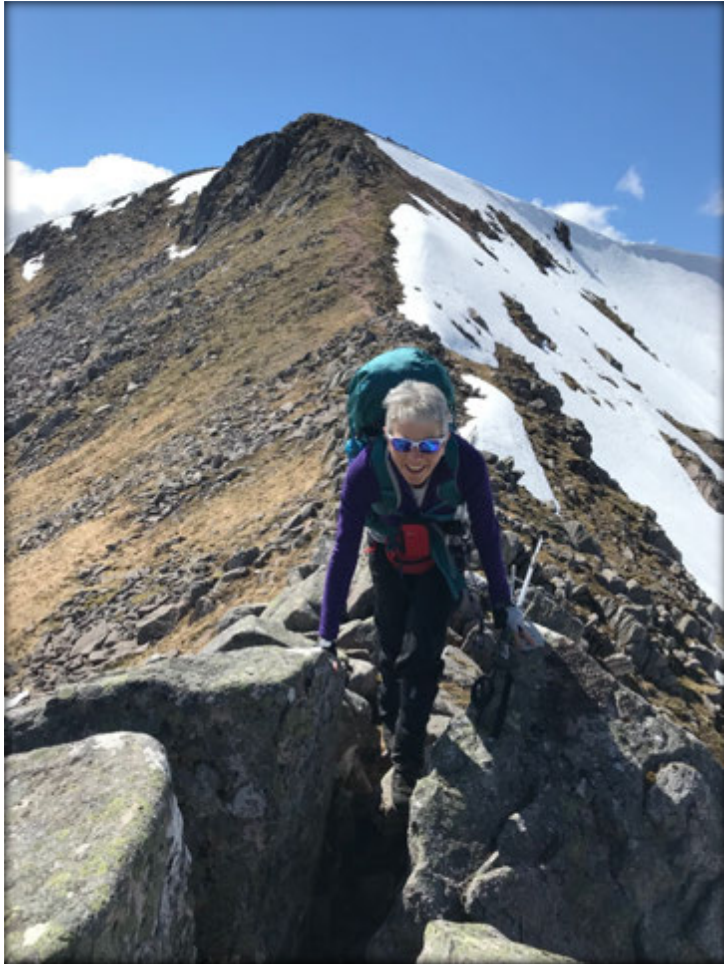
Photographer Anne Sinclair